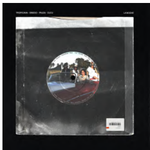
8 "La Noche" Singles