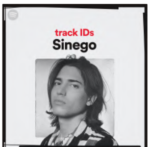
Spotify Track IDs