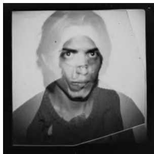
Alterego Debut Album Release