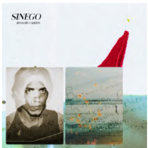
11 "El Día" Singles