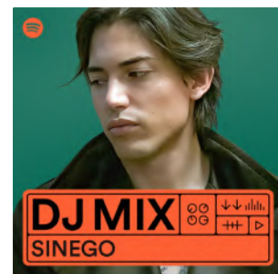
Spotify DJ Mix