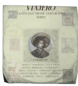
Viajero Apple Music DJ Mixes Series