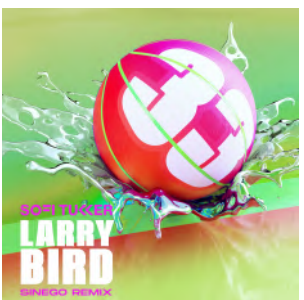
Sofi Tukker - Larry Bird (Sinego Remix)